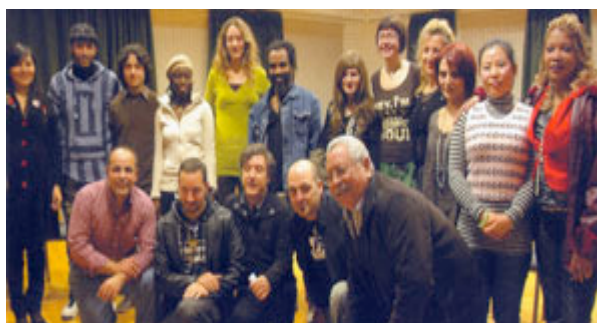
Some of the musicians.

" Aiguallum. Veus de la Diversitat " is a project that has culminated in the publication of a CD-book gathering 21 new citizens of Manresa, a town located near Barcelona city, in Catalonia, Spain. These amateur artists from all over the world sing songs whose lyrics are related to Water and Light, a theme chosen because these natural elements play an important role in the history of Manresa. Some of the lyrics also speak of love and nature.